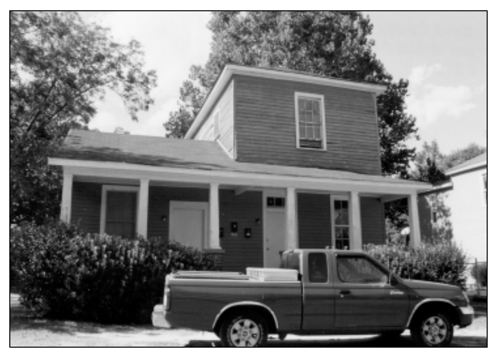
Plate 7: (above) Duplex with two-story unit and one-story unit