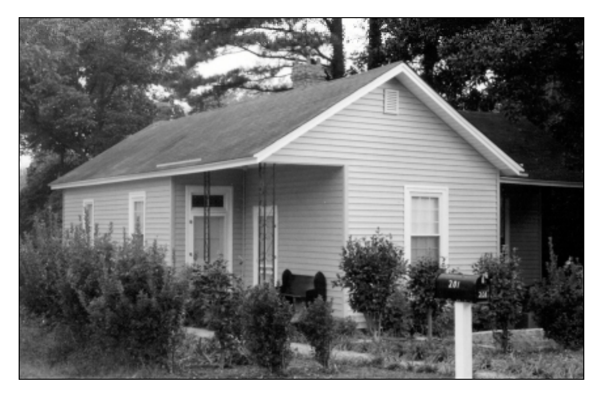
Plate 4: Gable-front house with inset porch

to a two-story, hip-roof unit with a full-width front porch. Each house had front and back porches, open brick pier foundations, weatherboard siding, brick chimneys, and six-over-six sash windows.