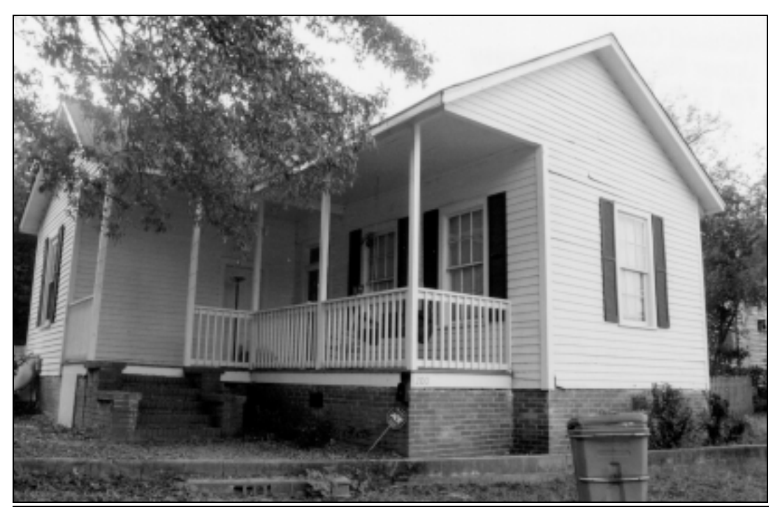
Plate 5: (above) One-story, L-shaped house

Plate 6: (below) Two-story, six-room house with saltbox shed