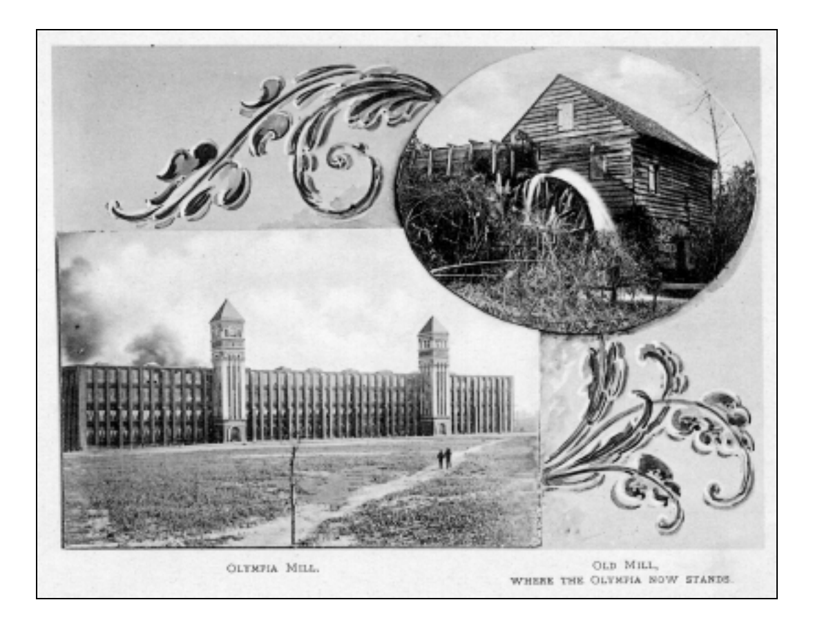
Plate 2: Olympia Mill, from a Columbia souvenir booklet, ca. 1910