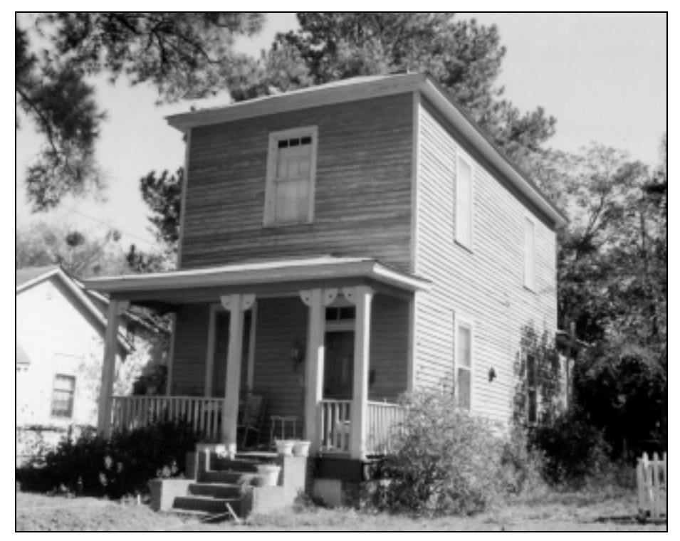
Plate 8: (below) Two-story shotgun house