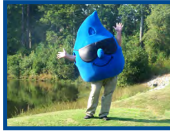
The Dripster says "Stormwater...Let's Keep it Clean"