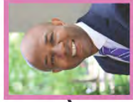
Overture Walker District 8