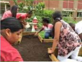
Catawba Trail Elementary School Garden