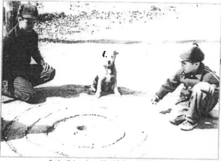
Greenville boys play marbles while Shaggy the Dog watches.

"I told him that the boys were playing with one marble and he was playing with three. I told him that was a game for boys."