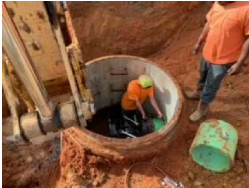
Photo 1: Valve install

The contractor installing valve on the Airbase Road (See photo 1). The crew will have a flagger on Airbase Road to help with traffic. A total of thirty-one (31) fire hydrants have been installed in Division 1.