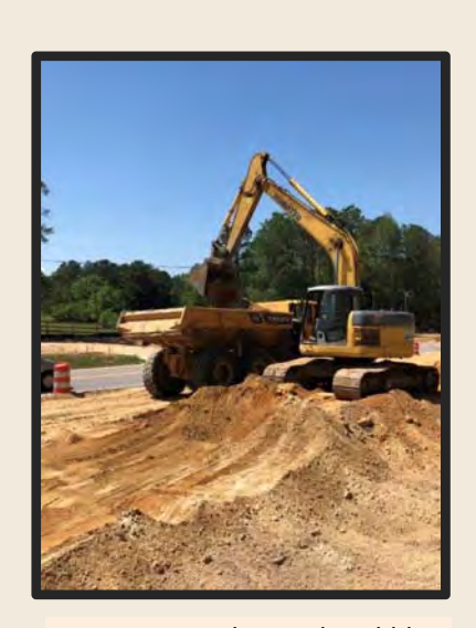
Progress on the Hardscrabble Road Widening project.