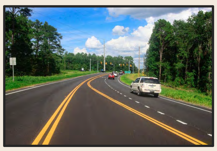
Construction of the Farrow Road and Pisgah Church Road Intersection Improvements was completed.