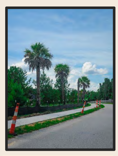
Harrington Road Sidewalk construction is underway.