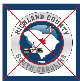
White on Dark Background